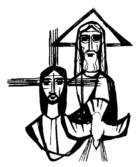
The Holy Trinity