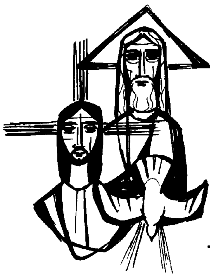
The Holy Trinity