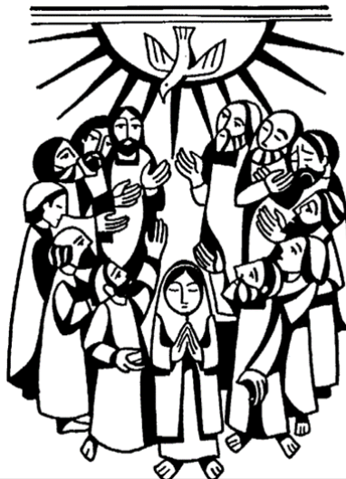
The Descent of the Holy Spirit

People: Thanks be to God. Alleluia, Alleluia.