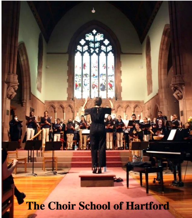
The Choir School of Hartford

Presents The Choir School of Hartford, a vibrant and diverse community of dedicated singers between the ages of 8 & 18.