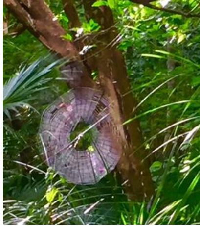
Gods wonder – a spider web