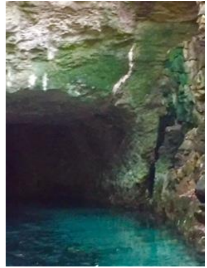
Beautiful limestone cave