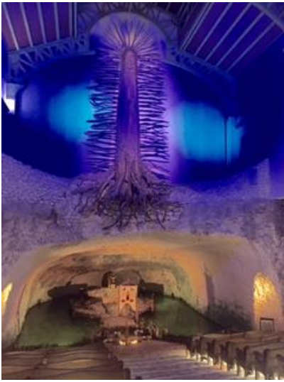
Beautiful Mexican chapel