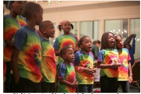
Children's Choir of Refugees from Democratic Republic of Congo in Lexington, Kentucky

The Domestic and Foreign Missionary Society will present a 90 minute webinar on October 15 focusing on the global refugee crisis, U.S. resettlement and how Episcopalians can be involved in this ministry of welcome. Presented by the Domestic and Foreign Missionary Society's Episcopal Migration Ministries and Episcopal Public Policy Network, the live webinar will begin at 8 pm.